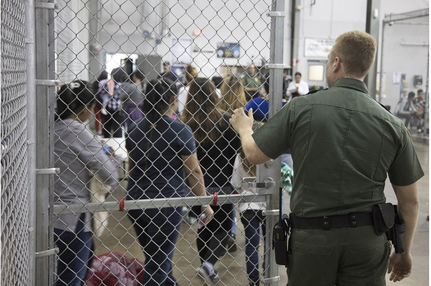
Women are seen inside a processing center in McAllen, Texas, in this undated U.S. Customs and Border Patrol handout photo.