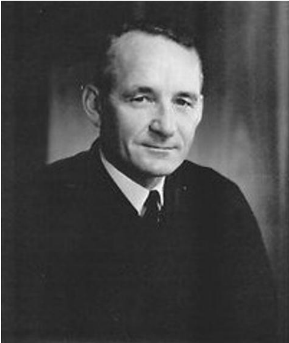
A 1968 portrait of U.S. District Judge Miles Lord

barricade or another, they gave security guards little hint of their pending felonious deed.