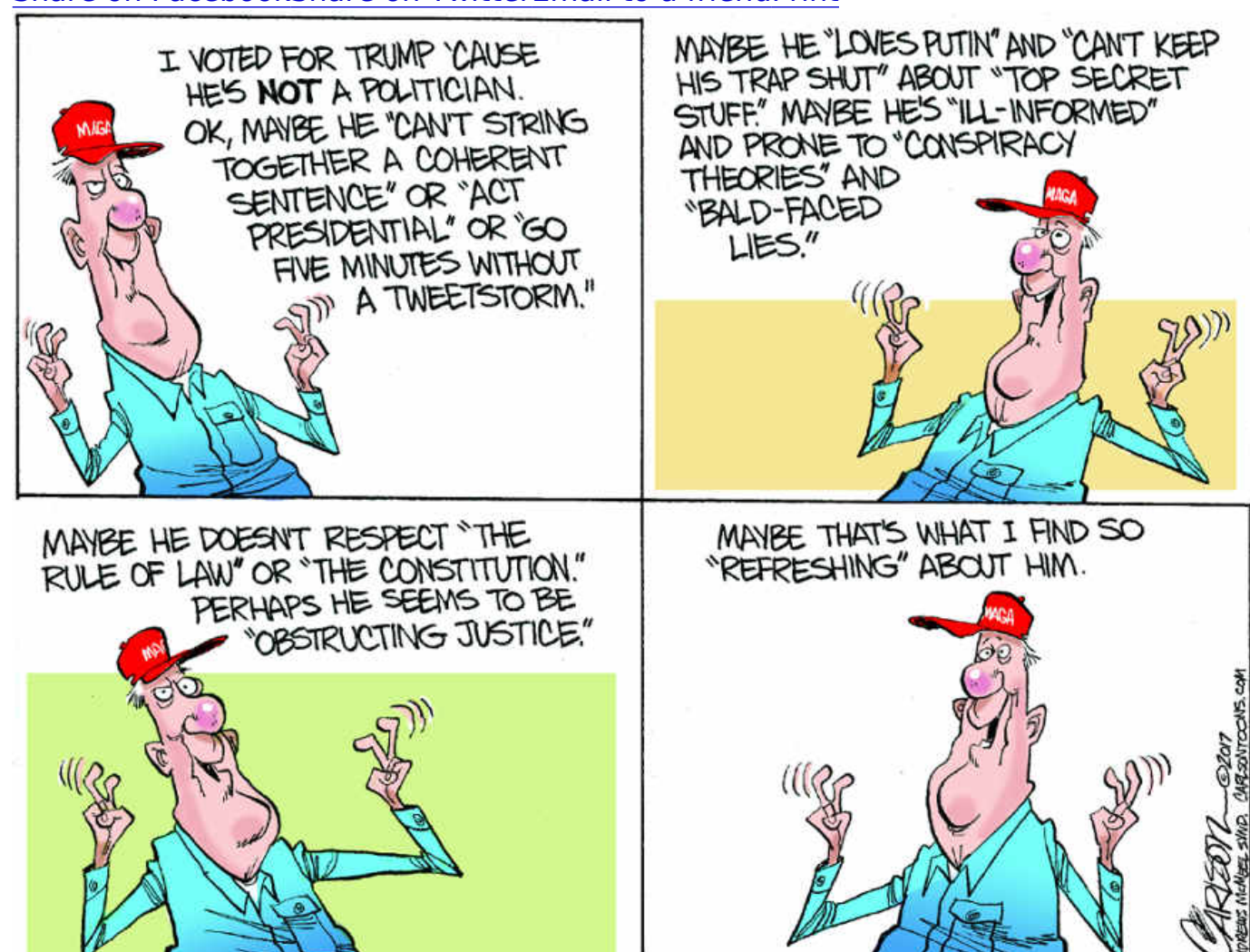
For more Editorial cartoons, click here.

Share on FacebookShare on TwitterEmail to a friendPrint