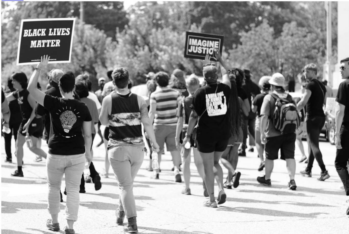
Participants at a 2017 Black Lives Matter demonstration in St. Louis. (Kristen Trudo)