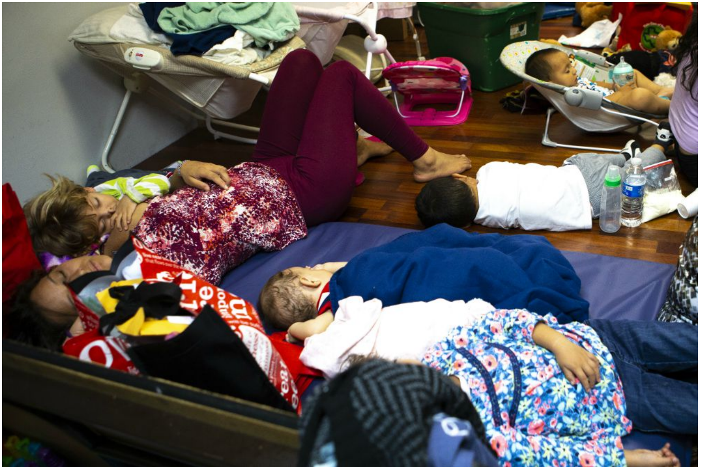
Exhausted immigrants, recently released from U.S. custody, sleep on the floor of a Catholic Charities-run respite center in McAllen, Texas, July 1.

Before the rule can go into effect, it is subject to a 60-day comment period to allow input from members of the public. The comment period is followed by 45-day delay to give administration officials the chance to review the comments and consider making changes.