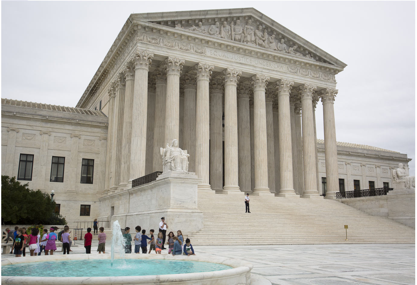
The U.S. Supreme Court building is seen in Washington Oct. 5.