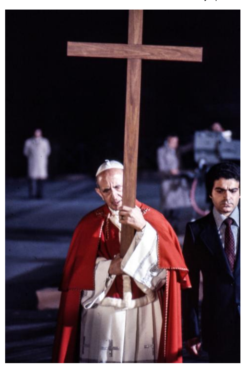
Pope Paul VI leads the Way of the Cross at the Colosseum in Rome in 1977.

and seven countries in Africa. In December 1958, John XXIII made him cardinal. He participated in preparations for the Second Vatican Council, but during the first session in 1962 he seemed unenthusiastic and only spoke twice.