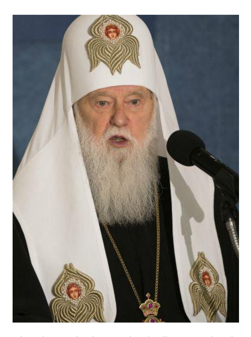
Ukranian Orthodox Patriarch Filaret Denisenko, 2015

The Kiev Patriarchate has backed Ukraine's pro-Western aspirations under its leader, Filaret Denisenko, who was declared anathematized by the Russian church in the early 1990s. By contrast, the Moscow-linked church has favored close links with Russia and rejected the independence drive.