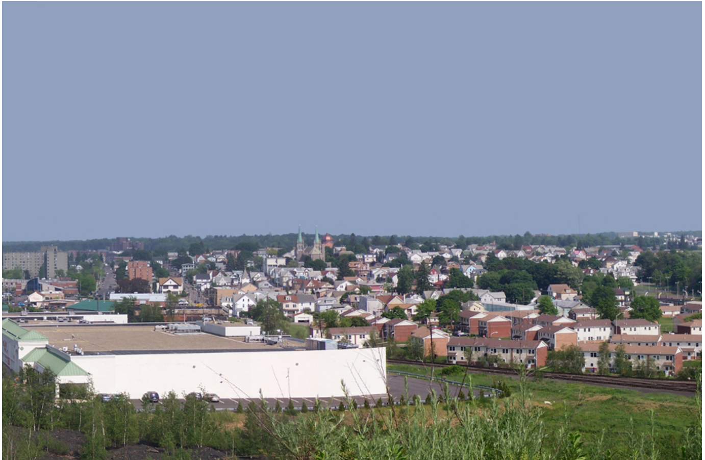
Downtown Hazleton, Pennsylvania