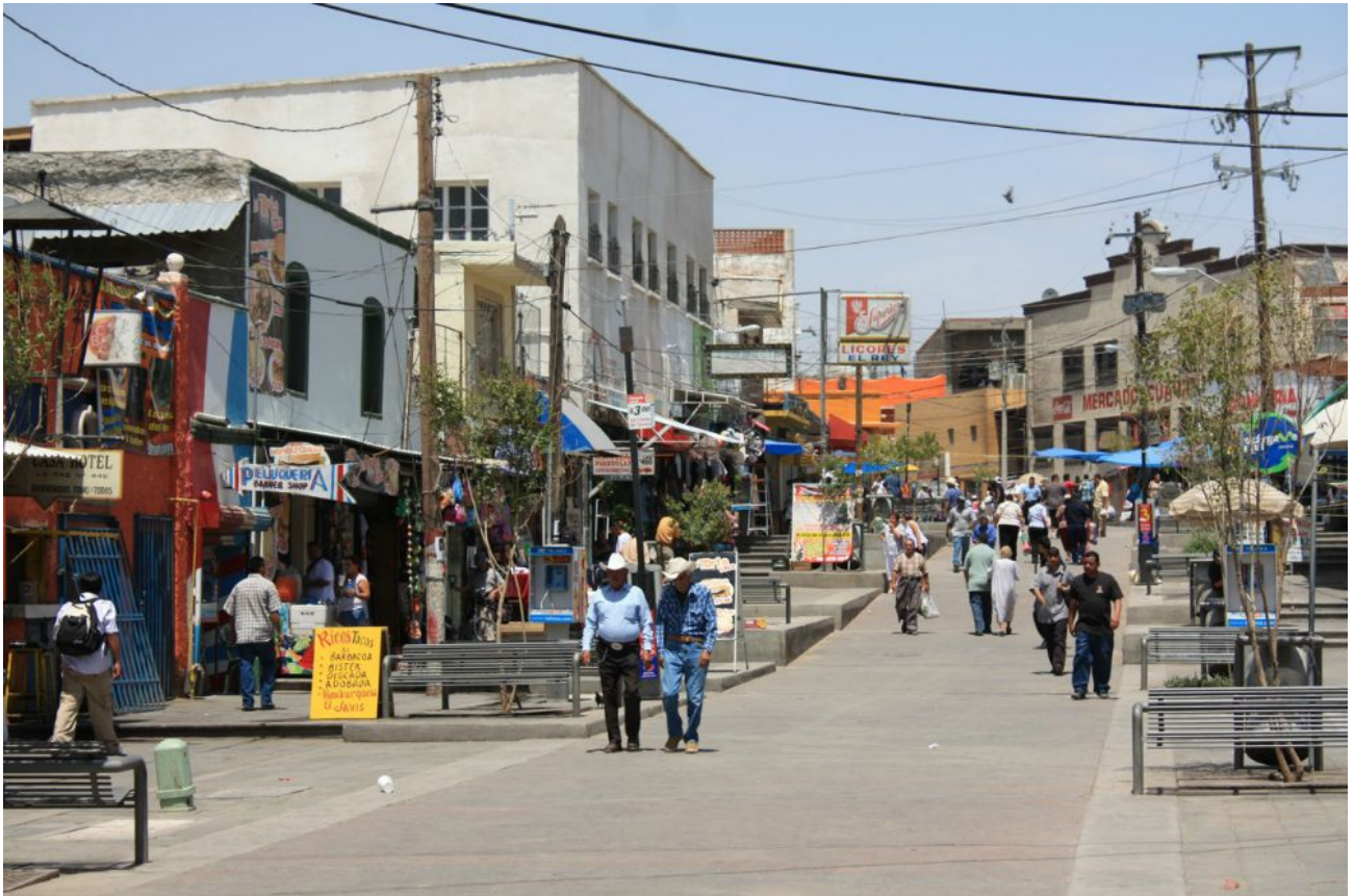
Ciudad Juárez, Mexico, 2008

Drivers wait to cross into El Paso, Texas, from Ciudad Juárez, Mexico, 2010