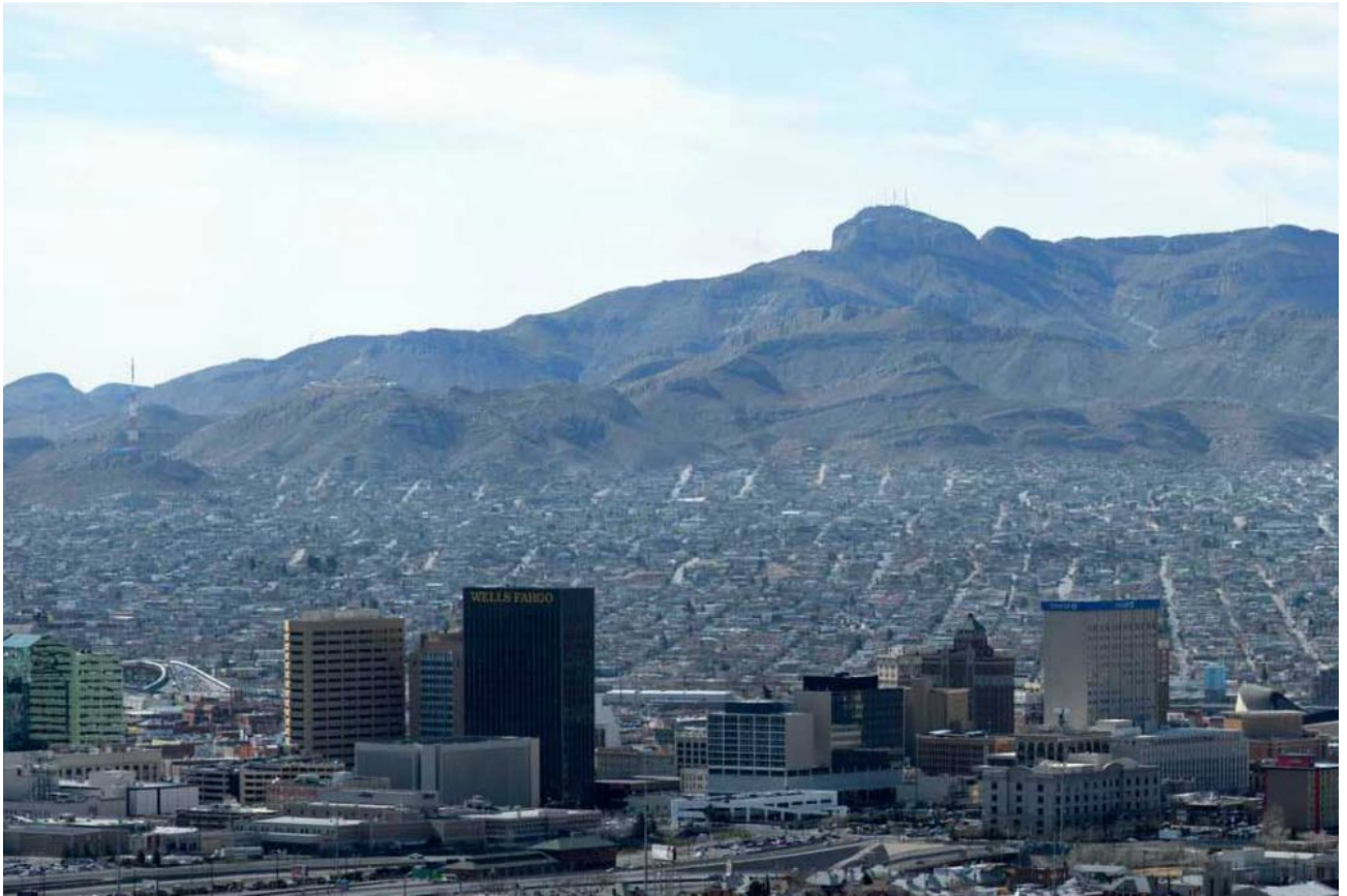
Downtown El Paso, Texas, 2009