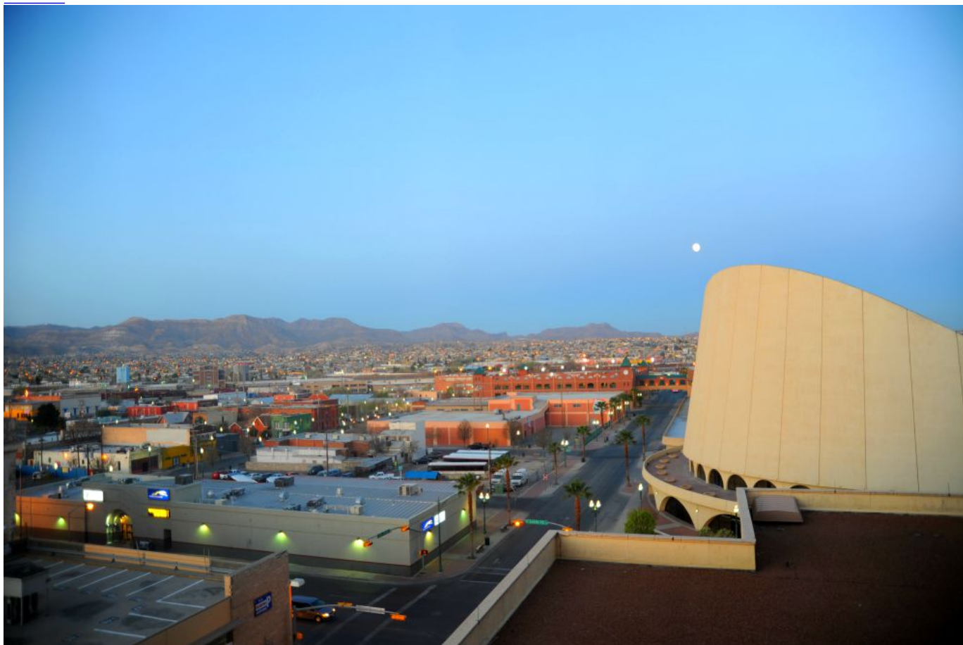
San Antonio Ave, El Paso, Texas, 2009, showing the Abraham Chavez Theater (Flickr/Andrew Poth)