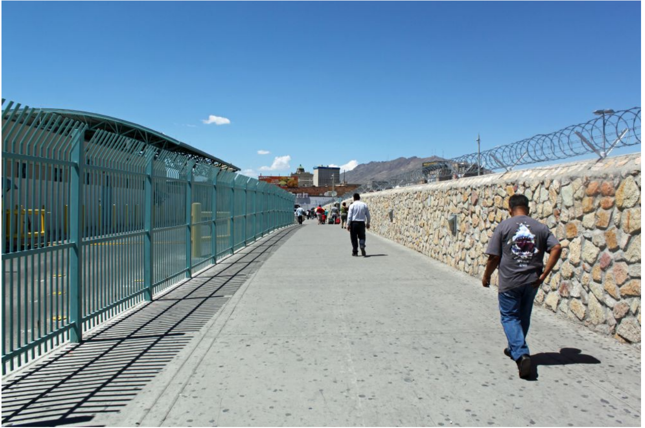
People walking from Ciudad Juárez, Mexico, to El Paso, Texas, 2010