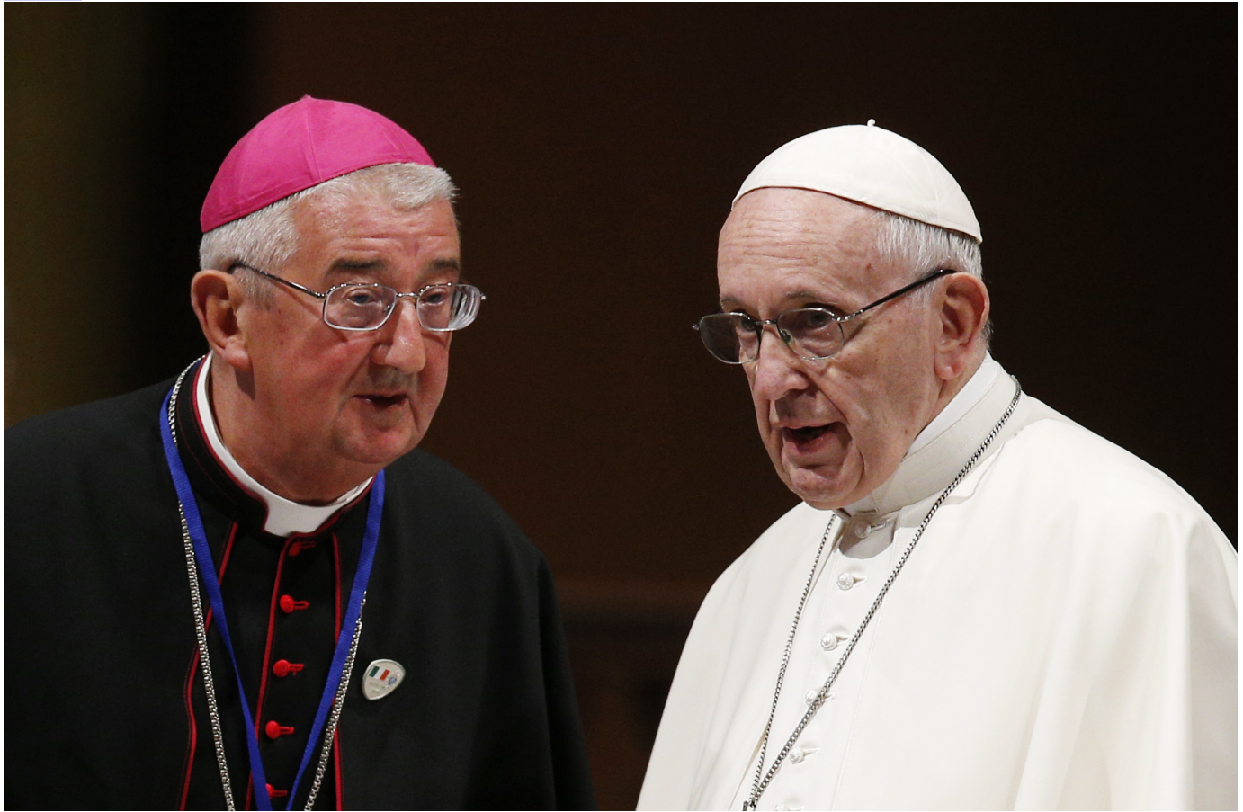
Pope Francis talks with Archbishop Diarmuid Martin of Dublin as he visits St. Mary's Pro-Cathedral in Dublin Aug. 25.