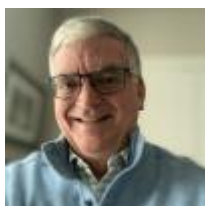
Peter Finney Jr.

New Orleans Archbishop Gregory Aymond is pictured in a 2017 photo. After reviewing more than 2,400 clergy files dating back nearly 70 years, the Archdiocese of New Orleans released the names of 55 priests and two deacons who had been removed from ministry for accusations of sexual abuse of a minor.