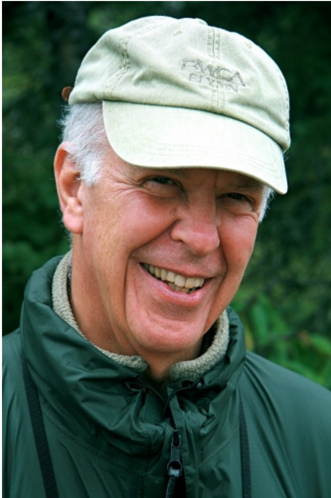
Parker J. Palmer