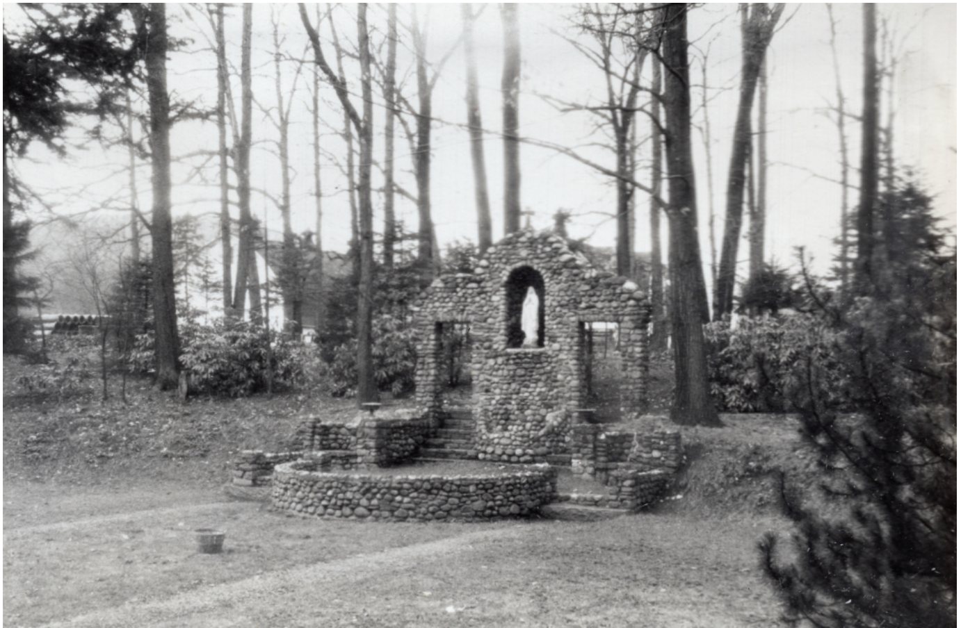
St. Bonaventure's Grotto of Our Lady of Lourdes, noted as a place for contemplation, was built by seminarians in 1925.