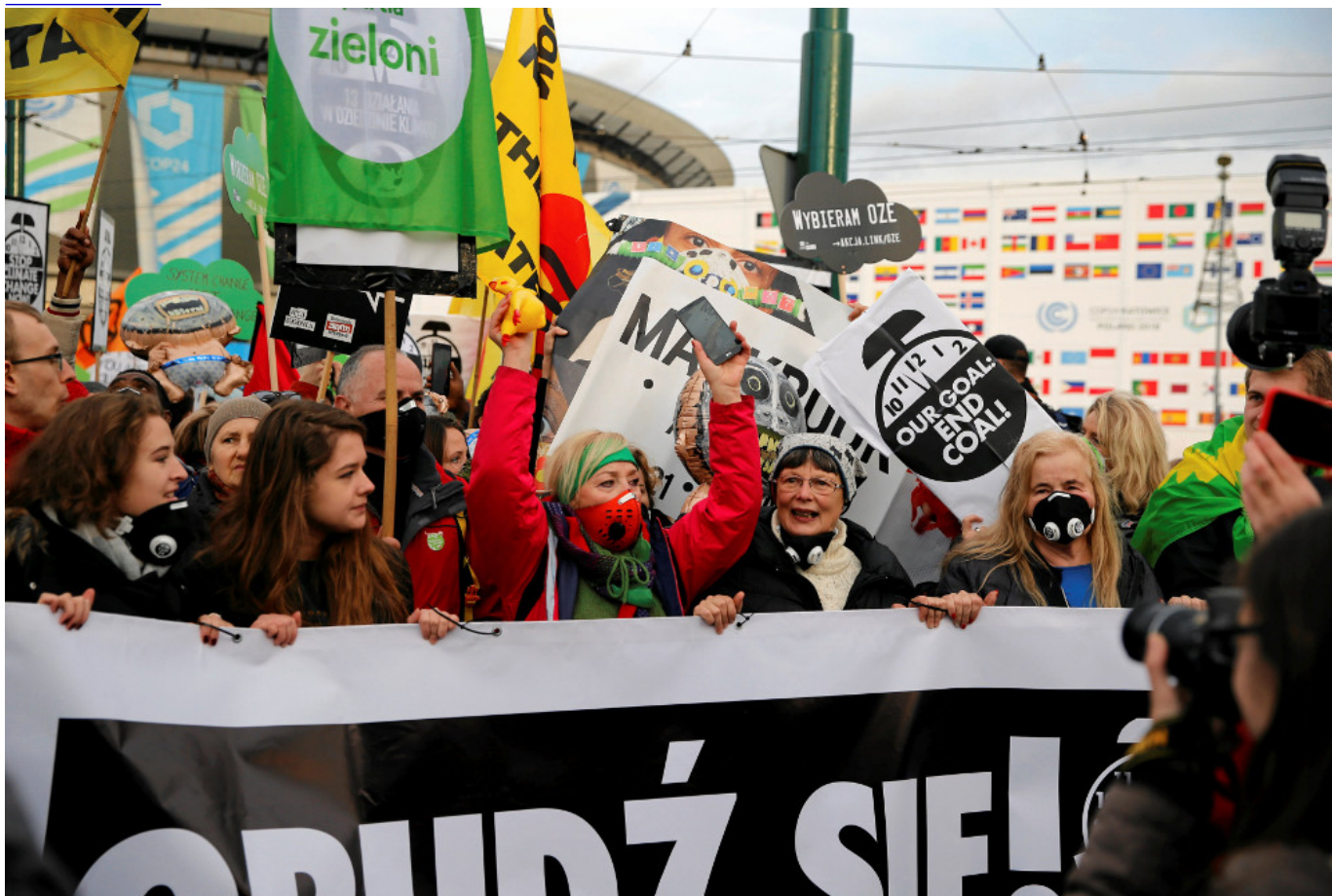
Protesters march outside the venue of the U.N. climate change conference, or COP24, Dec. 8 in Katowice, Poland.