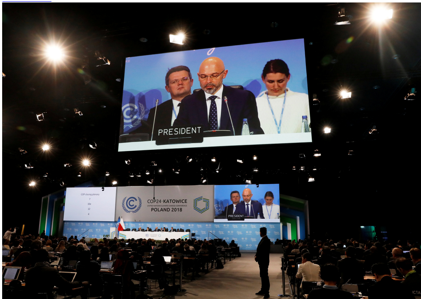
COP24 President Michal Kurtyka speaks during a final session of the U.N. climate change conference in Katowice, Poland, Dec. 15.