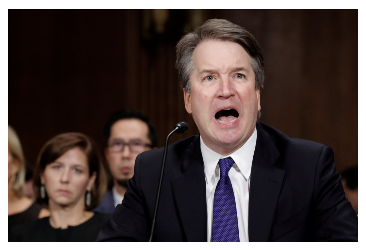
U.S. Supreme Court nominee Judge Brett Kavanaugh testifies before a Sept. 27 Senate Judiciary Committee hearing on Capitol Hill in Washington. Kavanaugh followed Professor Christine Blasey Ford, who testified about her accusation that he sexually assaulted her in 1982, a claim he vehemently denied.

The Senate confirmed Kavanaugh as a Supreme Court justice in a 50-48 vote Oct. 6, days after the Supreme Court had resumed its new term.