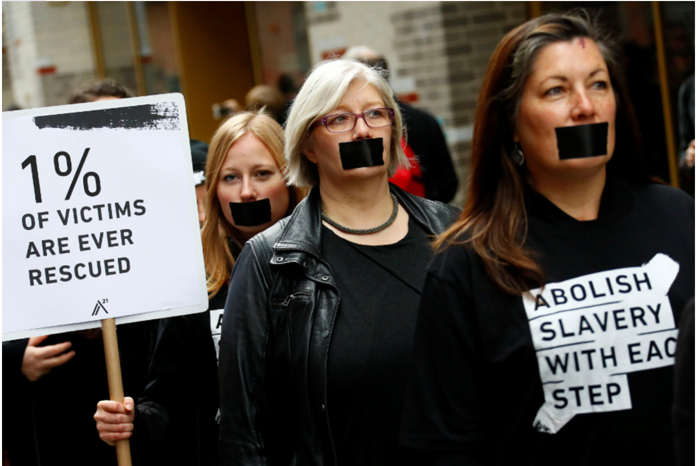
Activists take part in a "Walk for Freedom" in 2018 to protest against human trafficking in Berlin.