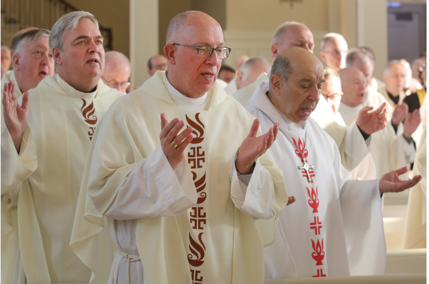
U.S. bishops pray during Mass in the Chapel of the Immaculate Conception at Mundelein Seminary Jan. 3 at the University of St. Mary of the Lake in Illinois, near Chicago.