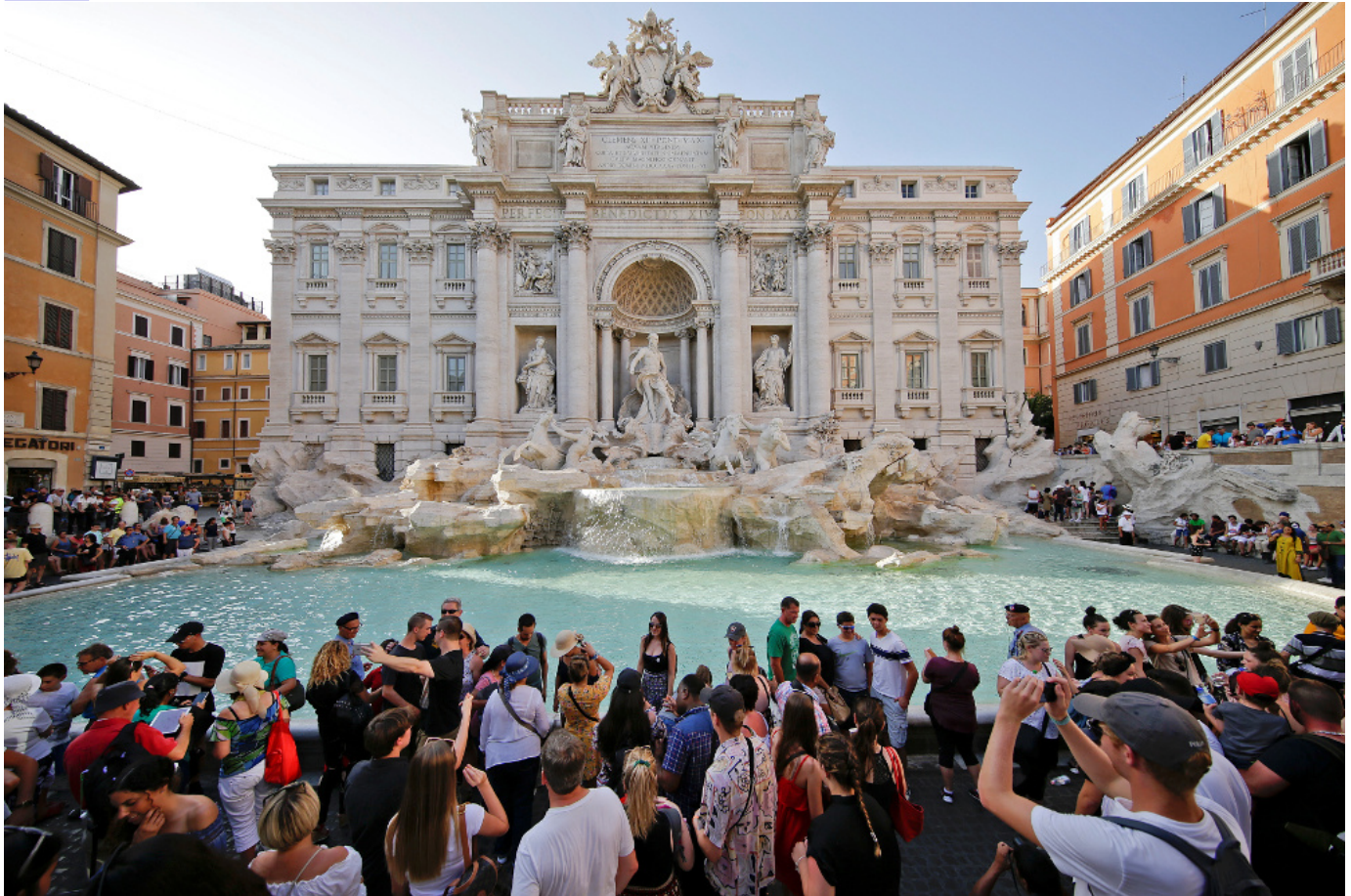
Tourists stand at Rome's Trevi Fountain Aug. 2, 2017.