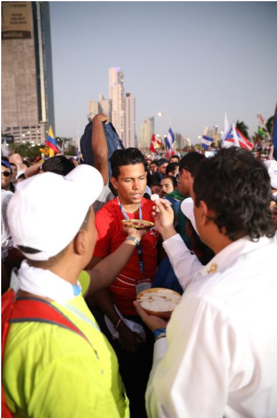
A pilgrim receives Communion during the opening Mass of World Youth Day in Panama City Jan. 22, 2019.

He wanted them to know, he said, that they were important and they were the reason for an enormous effort of human mobilization that allowed their pilgrimage to happen.