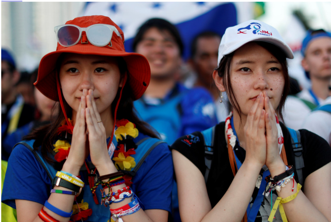
Pilgrims pray during the opening Mass of World Youth Day in Panama City Jan. 22, 2019.