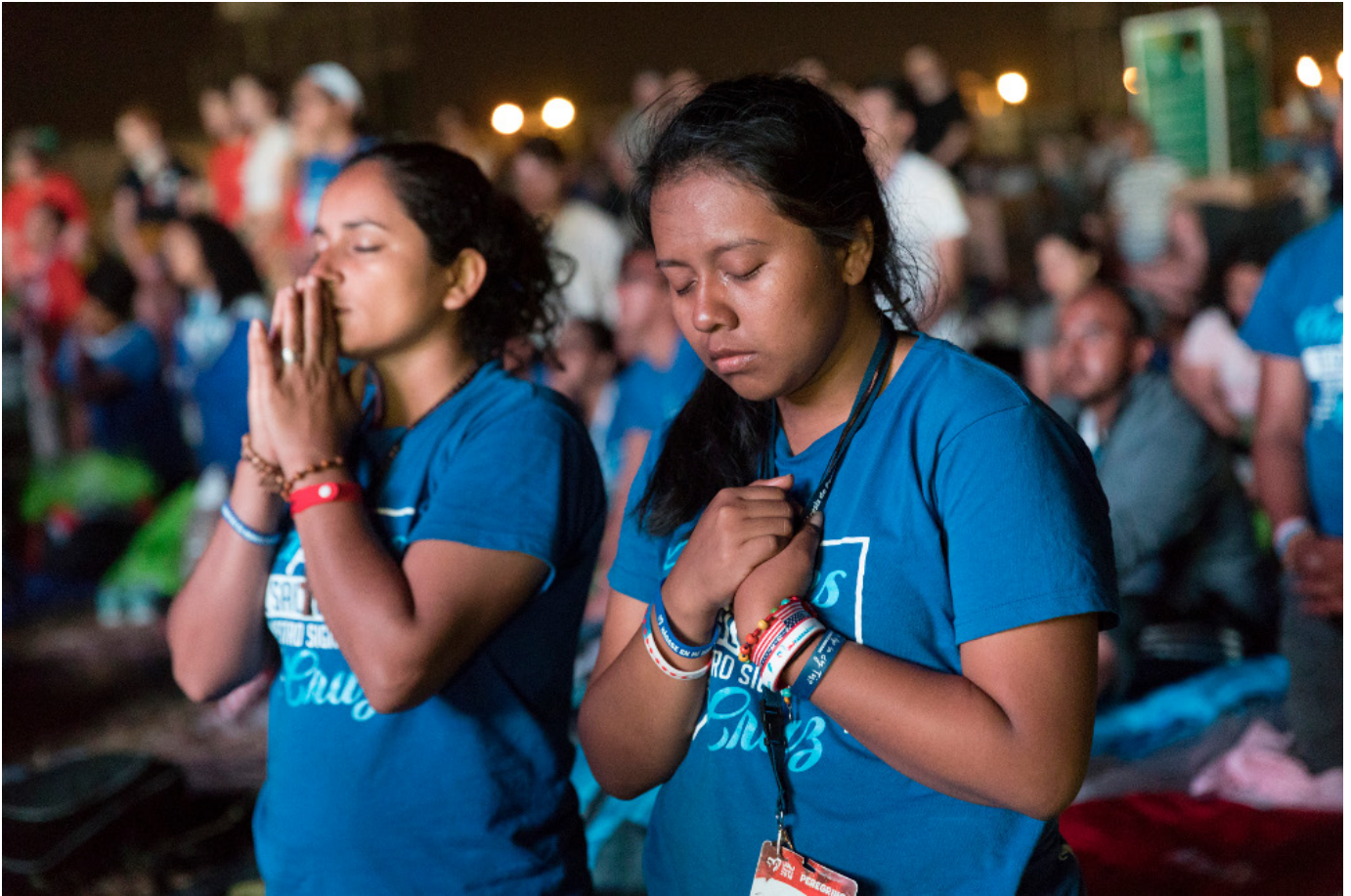
Pilgrims pray during Pope Francis' World Youth Day vigil at St. John Paul II Field in Panama City Jan. 26.