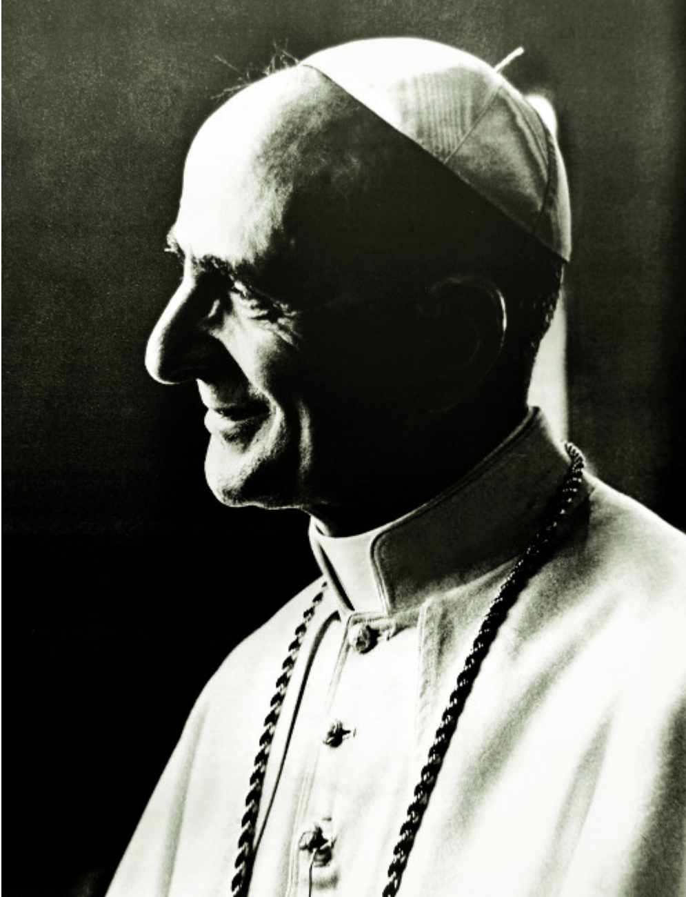
Pope Paul VI is pictured in this undated photo.