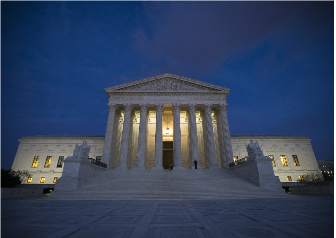
The U.S. Supreme Court is seen in Washington Dec. 3, 2018.