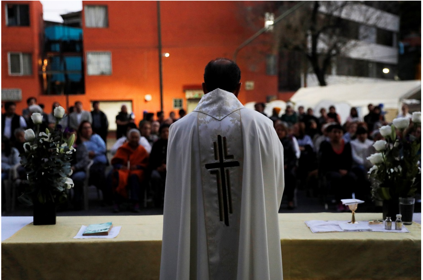
A priest in Mexico City celebrates Mass Jan. 11, 2018.