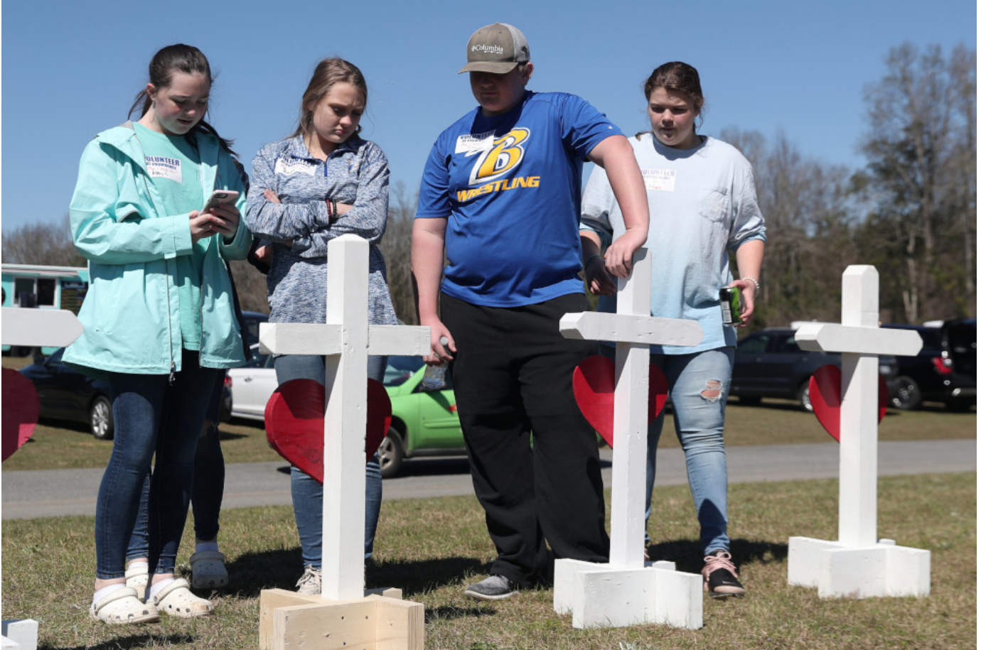
People in Beauregard, Ala., stand in front of crosses March 6, 2019, to honor the victims who died in the two tornadoes.