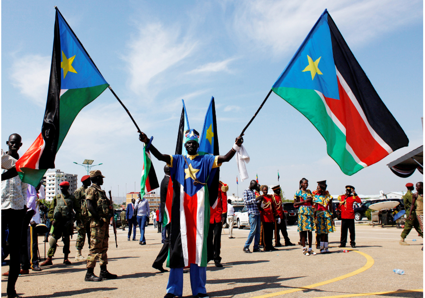
A man in Juba, South Sudan, carries South Sudanese flags near the John Garang's Mausoleum Oct. 31, 2018.