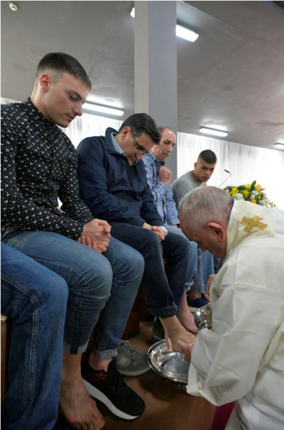
Pope Francis washes the feet of an inmate during a Holy Thursday celebration at Velletri Correctional Facility, 36 miles south of Rome.

As Francis made his way into the room at the start of the Mass, the detainees were unable to contain their joy. The solemnity of the opening procession was interrupted by the applause and cheers of the detainees upon seeing the pope.