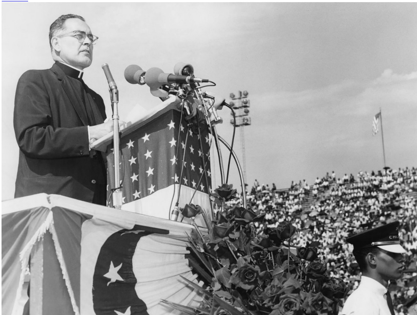
Holy Cross Fr. Theodore Hesburgh speaks at the Illinois Rally for Civil Rights in Chicago in 1964.