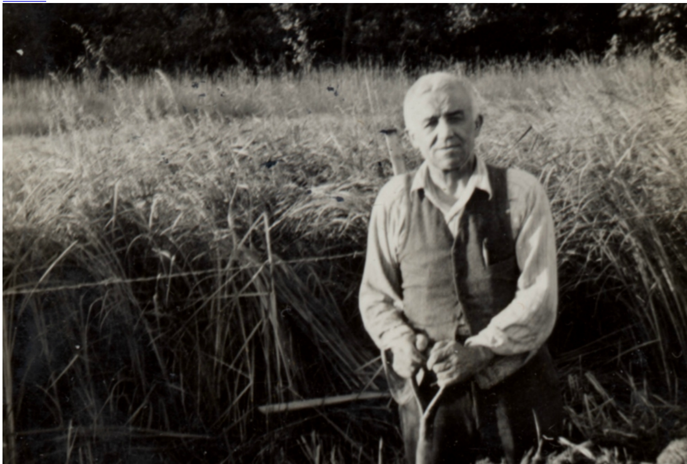
Catholic Worker co-founder Peter Maurin at St. Isidore's Farm in Aitkin, Minnesota, in 1941