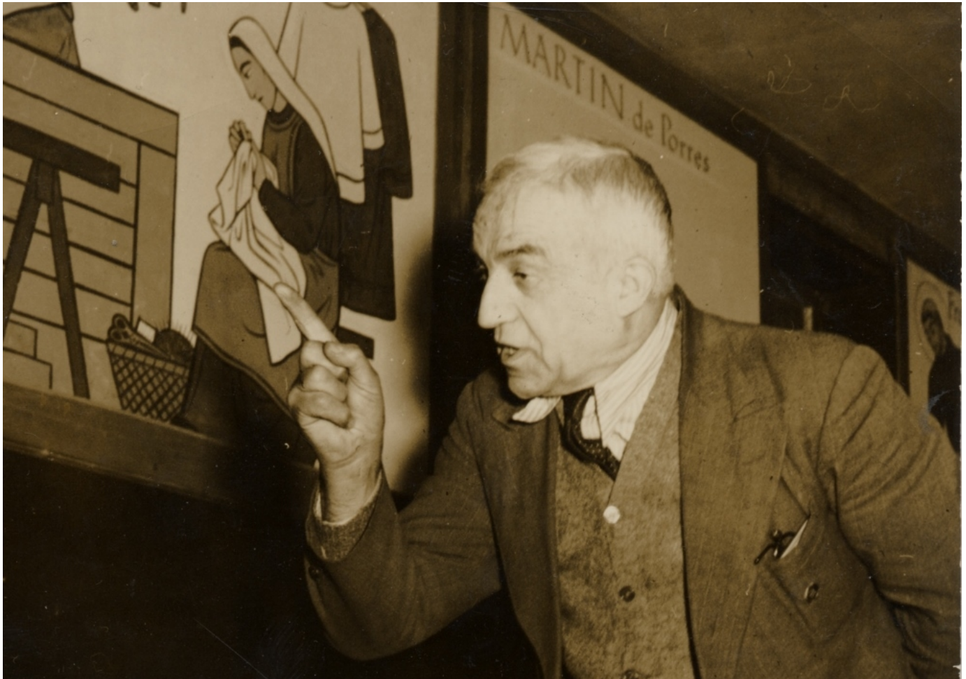
Peter Maurin in the 1930s

While he outlined a three-point program of action — roundtable discussions for "the clarification of thought," houses of hospitality where the works of mercy could be practiced, and founding farming communes or "agronomic universities" — Maurin needed help to implement his vision. In 1932, he sought out Day, a journalist and Catholic convert living in New York City.