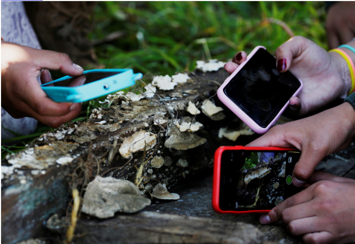
Students take photographs of mushrooms in Cota Cota, La Paz, Bolivia, April 29, 2019.