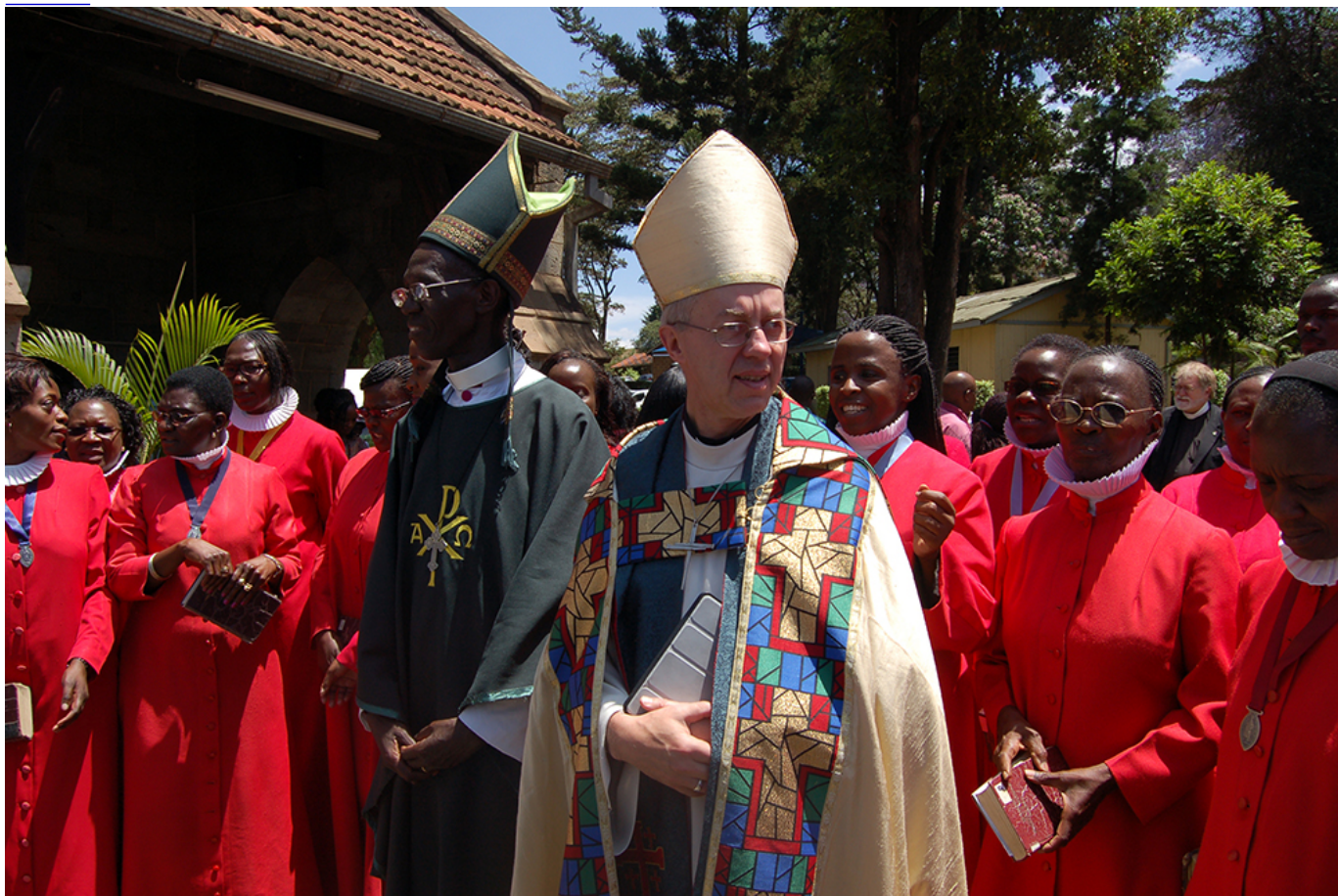
Archbishop of Canterbury Justin Welby, center, during a 2013 visit to Nairobi, Kenya.