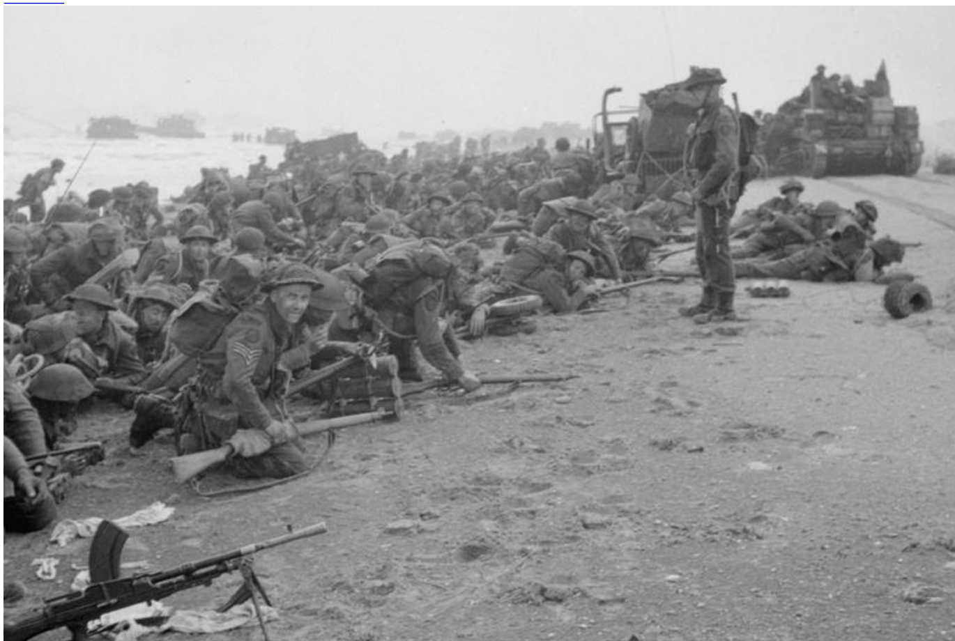
British commandos of 1st Special Service Brigade crouch on Queen beach, Sword area, before moving inland on June 6, 1944.