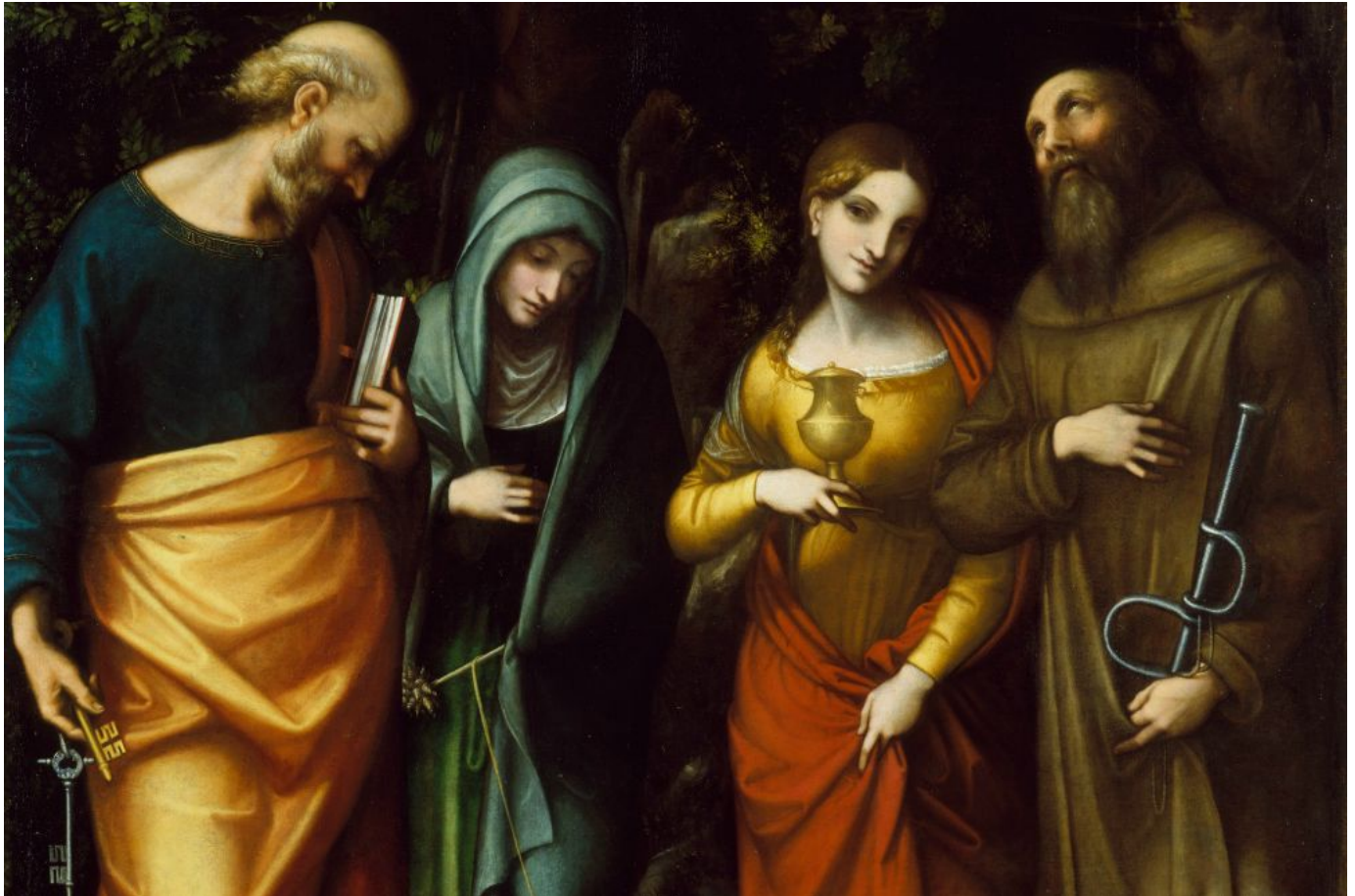
"Sts. Peter, Martha, Mary Magdalen and Leonard," painting by Correggio (Antonio Allegri), circa 1515