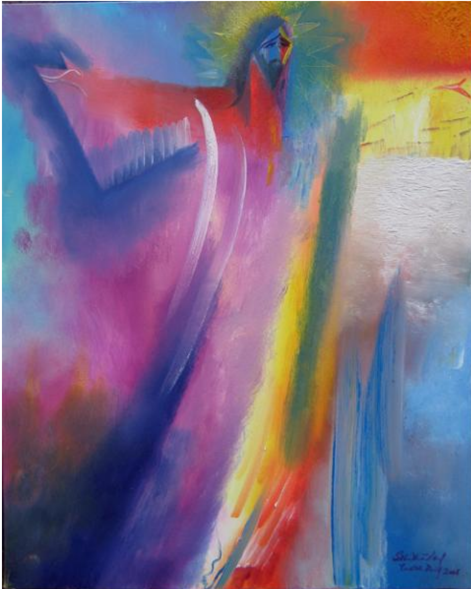
"The Glory of Christ" by Stephen Whatley, an expressionist artist based in London (CNS/Stephen B. Whatley)

The Christ mystery is the "transcendent" element in everything, but also the "infinite horizon" that pulls all things forward; it is the name for everything in its fullness. As a consequence, creation is both the hiding place and the place where God is revealed.