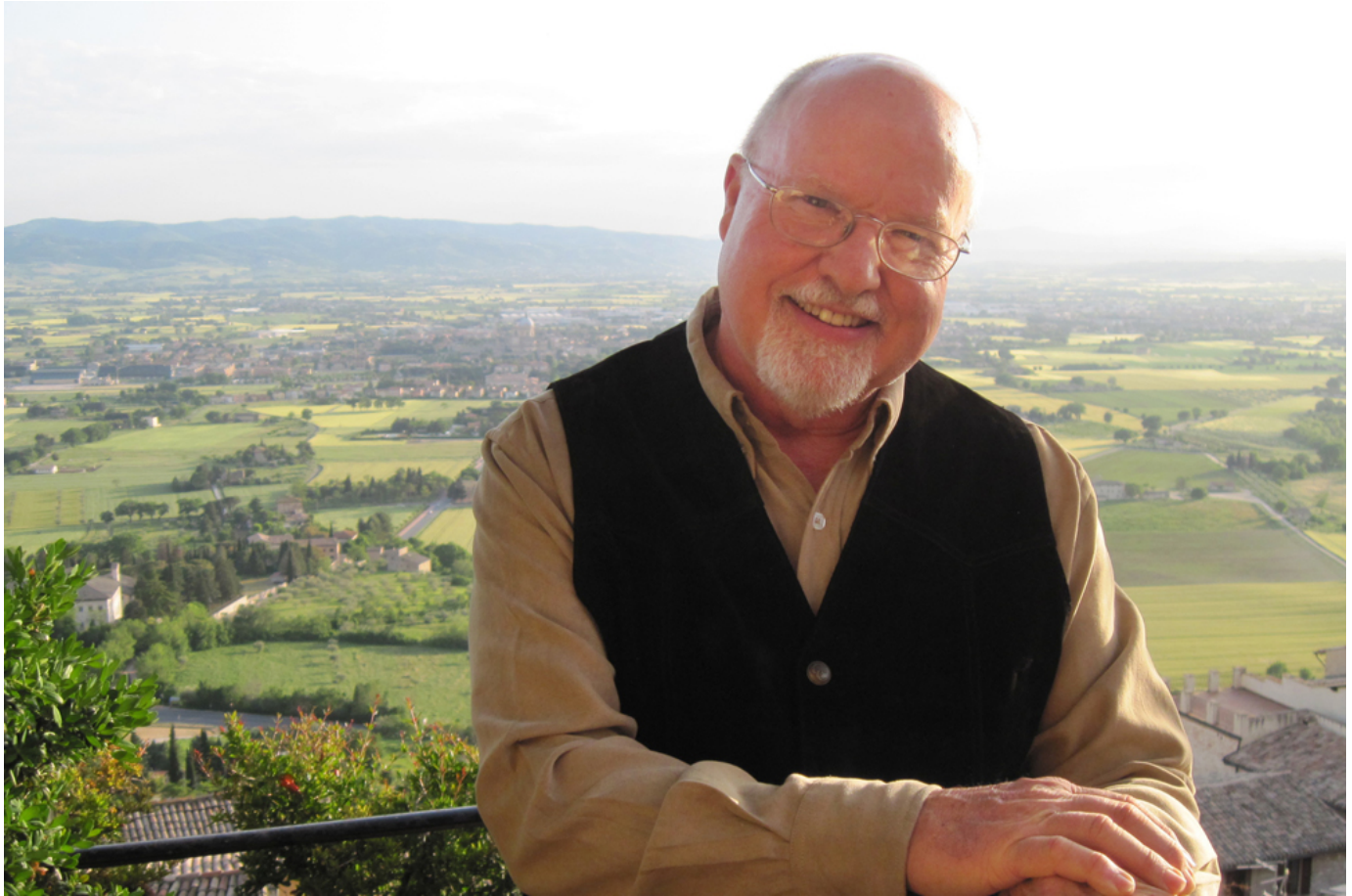
Franciscan Father Richard Rohr is seen in this 2012 photo during a trip to Assisi, Italy.

Opinion Spirituality Culture Book Reviews