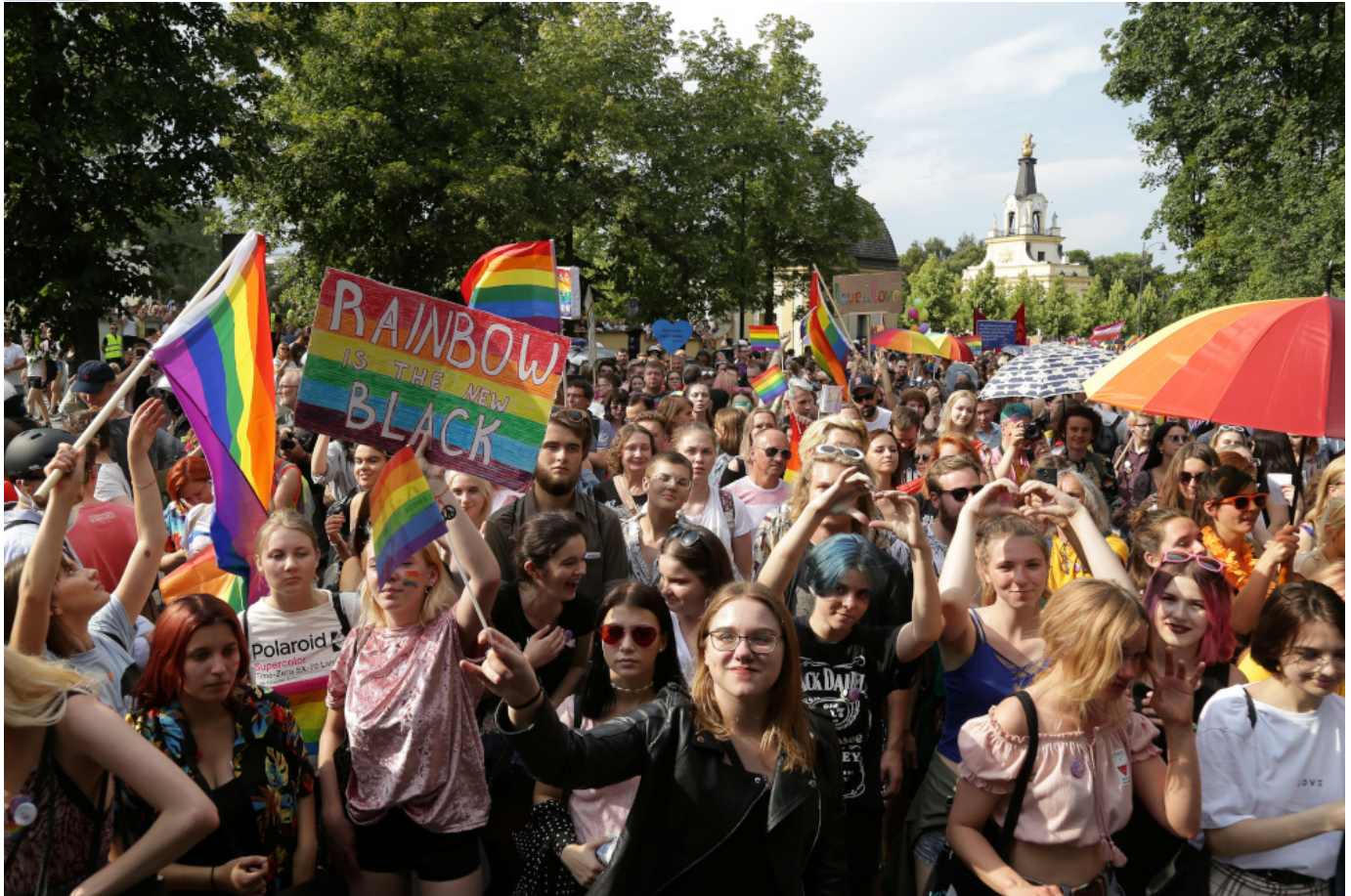
Participants take part in the city's first "Equality Parade" rally in support of the LGBT community in Bialystok, Poland, July 20, 2019.