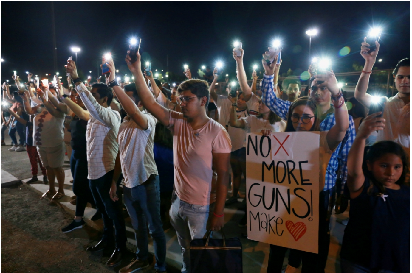
Mourners take part in a vigil near the border fence between Mexico and the U.S. after a mass shooting at a Walmart store in El Paso, Texas, Aug. 3.