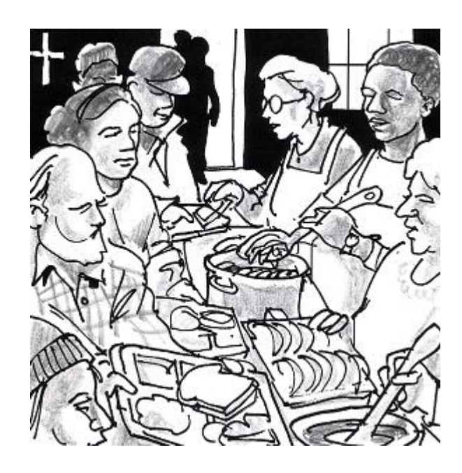
"I cannot carry all this people by myself, for they are too heavy for me" (Num 11:14).

The burden of leadership is highlighted in both of today's readings. Moses is weighed down by the demands of the people for food in the desert to the point that he asks God to take his life. Jesus, grieving after the death of John the Baptist, tries to withdraw but encounters a large, hungry crowd waiting for him in the wilderness. Unlike Moses, he is moved with pity and multiplies bread and fish to feed over 5,000 people.