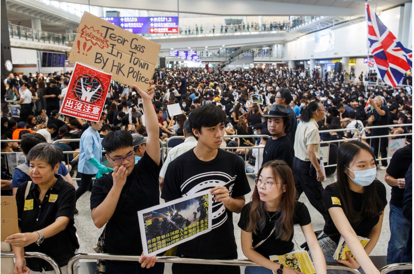
Anti-extradition bill protesters hold placards for arriving travelers during a protest at Hong Kong International Airport Aug. 9.