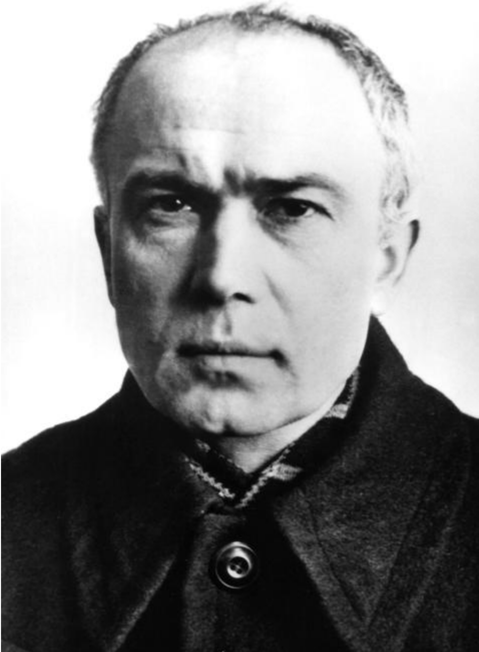
Fr. Maximilian Kolbe is pictured in an undated black-and-white file photo.

"All wars have direct and indirect consequences," said Schick. "The direct consequences are the deaths of soldiers and civilians, destruction of cities, villages and entire regions. Thus many human relationships are shattered and many souls are wounded."