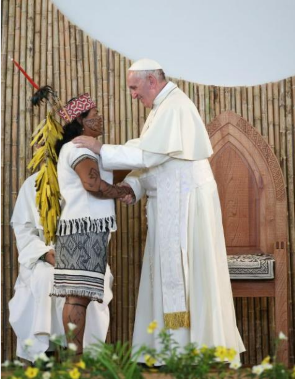
Pope Francis is greeted by a member of an indigenous group from the Amazon region during a meeting at the Coliseo Regional Madre de Dios in Puerto Maldonado, Peru, Jan. 19, 2018.

this synod would draw global attention to a region that has seen indigenous peoples robbed of both their land and their right to self-determination. These peoples have often been victims of drug and human trafficking. Moreover, there are more than 100 indigenous communities in that region that are "voluntarily isolated" from the larger world; their fragile existence is now under threat. Francis is committed to a polyhedral vision of both church and society, where genuine cultural differences do not threaten but rather enrich an authentic global consciousness.