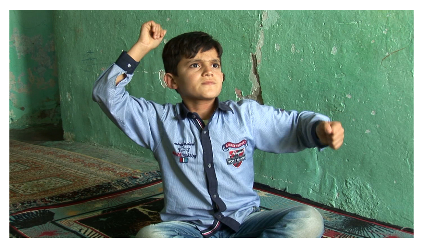
This is a still image from the 2016 video by Erkan Ozgen called "Wonderland."

Where a news item will document singular moments of difficulty, struggle, trauma and sometimes death that a displaced person may face, the exhibit's photos, the audio playing in the background of migrants' voices, videos of the empty and uninviting landscapes some of them have traveled through bring together the totality of the experience. Though it seems as if hope is absent and the "warmth" promised in the exhibit's title is all but missing, perhaps it can be found in the space known as the "Rothko room," where the migrant's shoes are temporarily residing.