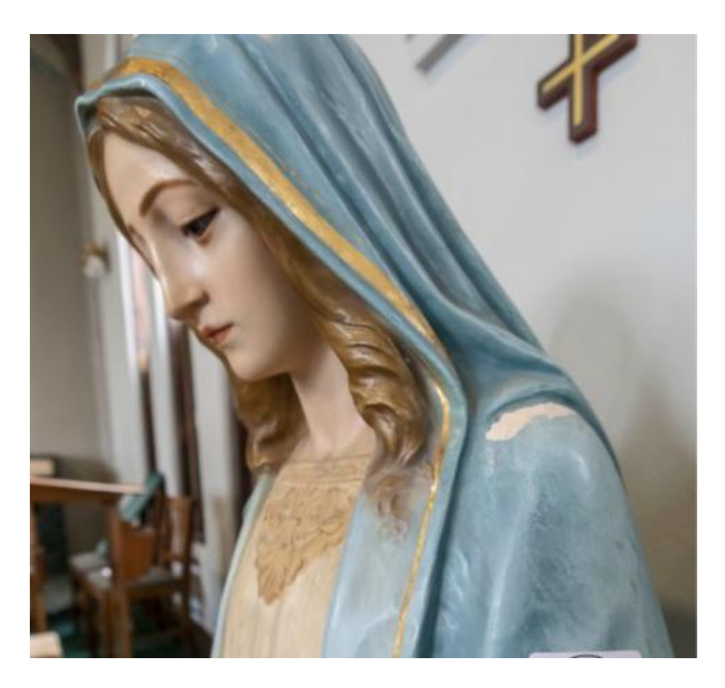
A statue of Mary is seen May 18 during an auction at St. Scholastica Monastery in Fort Smith, Arkansas.