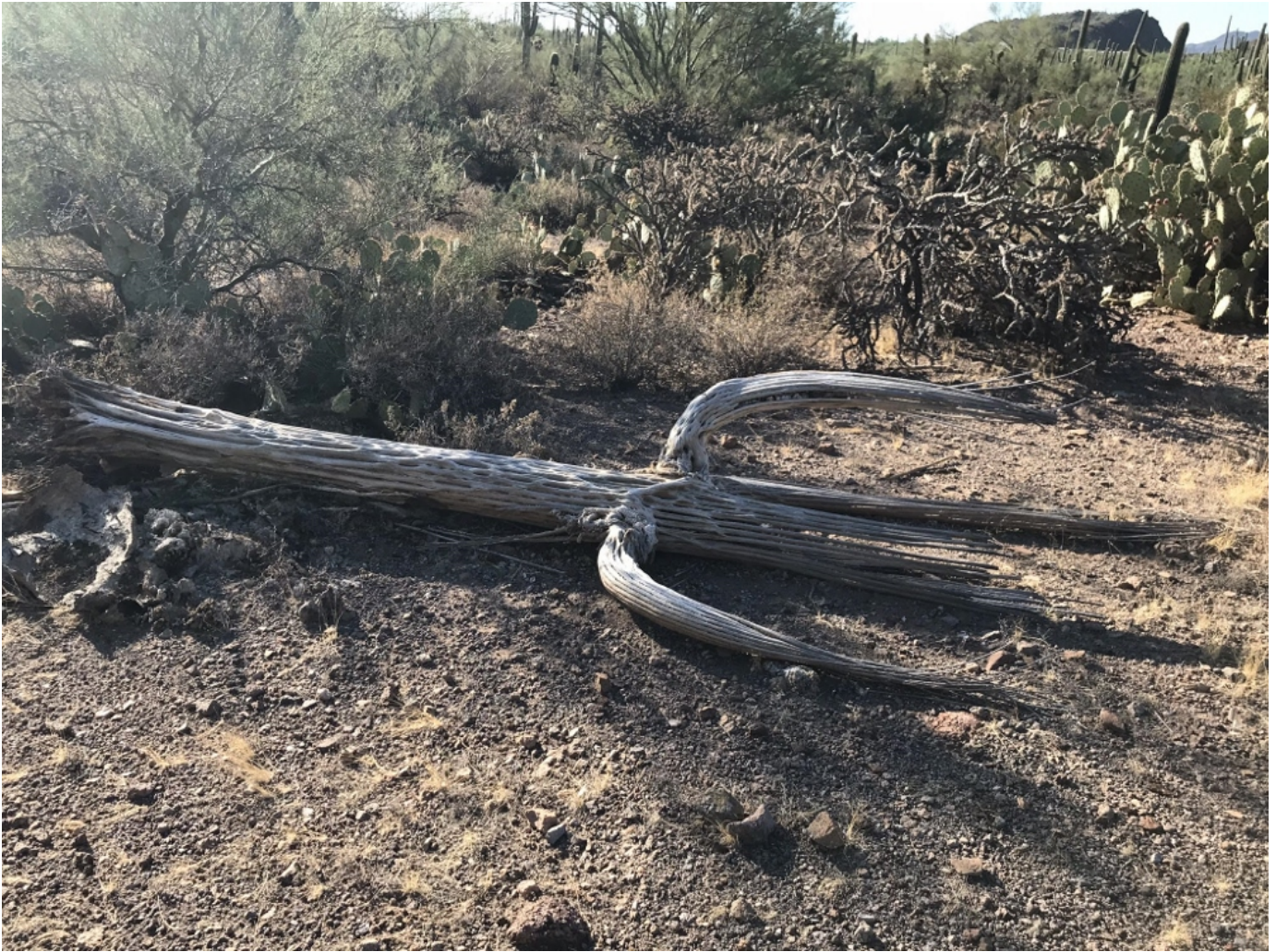
The fibrous skeleton of a dead saguaro cactus

On day three, I decided to touch a saguaro, which felt to me like a heroic act. I got close enough to find a break in the spines where I could touch the green skin without fear of losing my hand. I put my fingers on the leathery flesh. It felt surprisingly substantial, smooth and safe. I loved the sturdy feel of it, and took it in with the comfort I would a maple tree back home in Indiana. When I leaned on the saguaro, it didn't topple over, the way for some reason I had imagined it might. In this moment, a kinship began: I wanted to learn as much as I could about these towering, sturdy, hollow, spiky creatures.