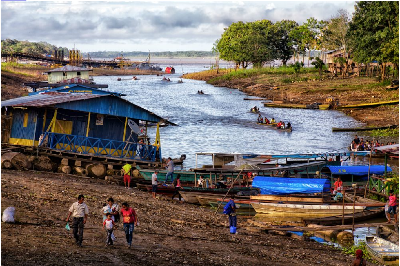
Harbor in Leticia, Colombia, July 2012