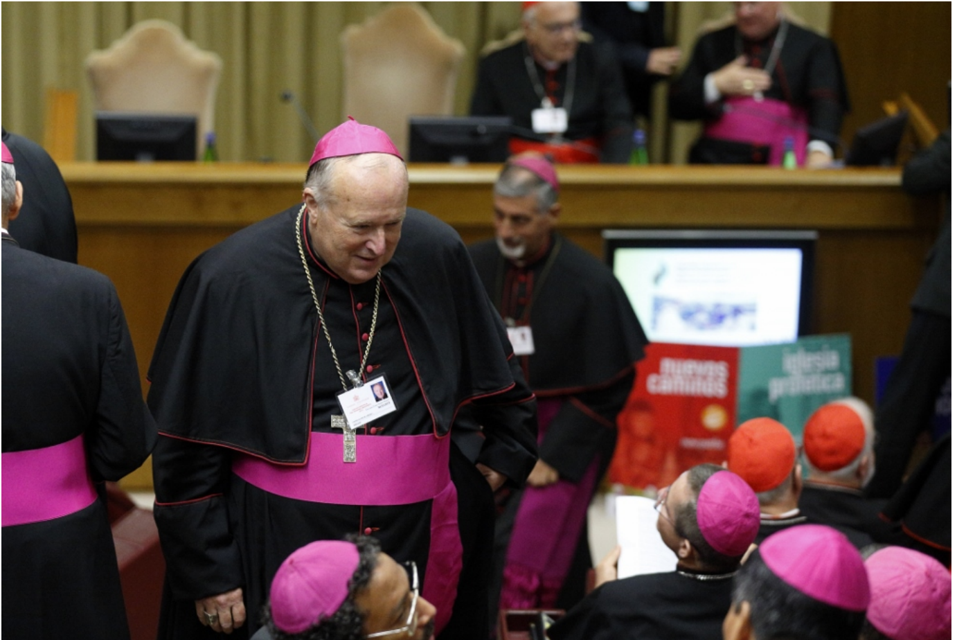
Bishop Robert McElroy of San Diego arrives for the first session of the Synod of Bishops for the Amazon at the Vatican Oct. 7.