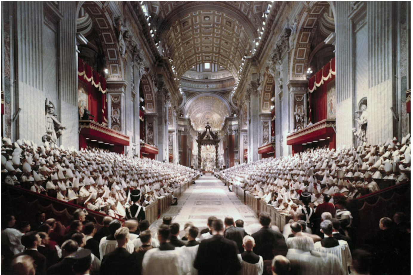
Pope John XXIII leads the opening session of the Second Vatican Council in St. Peter's Basilica at the Vatican Oct. 11, 1962.

This book is recommended to anyone who struggles to understand the meaning of the Second Vatican Council and who is not enlightened by the polarized antagonisms of recent decades. It is a long book, admirably clear in the way it approaches sometimes complex issues, and rewards the reader from its first word to its last.