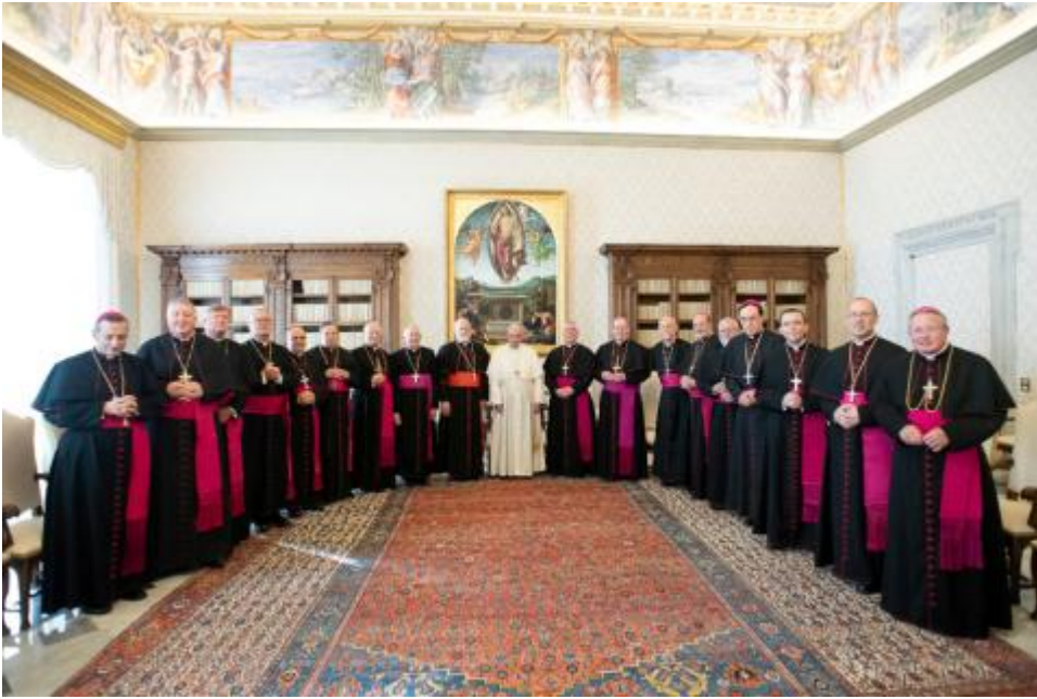
Pope Francis poses with U.S. bishops from New England during their "ad limina" visits at the Vatican Nov. 7, 2019.

"Overall, both with the Holy Father and with the Vatican offices, the dicasteries, there is certainly a little bit less formality" that in previous years, Tobin told CNS. Although "it was still very well organized."