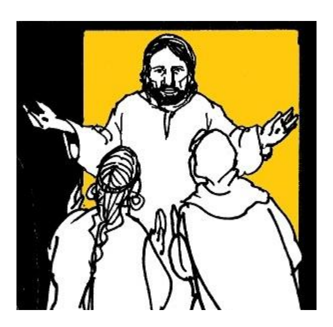
"Behold, the kingdom of God is among you" (Luke 17:22).

The complexity of our current political moment is compounded by deeper issues and questions regarding the nature of truth itself. What is truth, and who is telling the truth? Are there only partisan versions of the truth, subjective perceptions slanted this way or that, but beyond any conclusive determination or objective judgment?