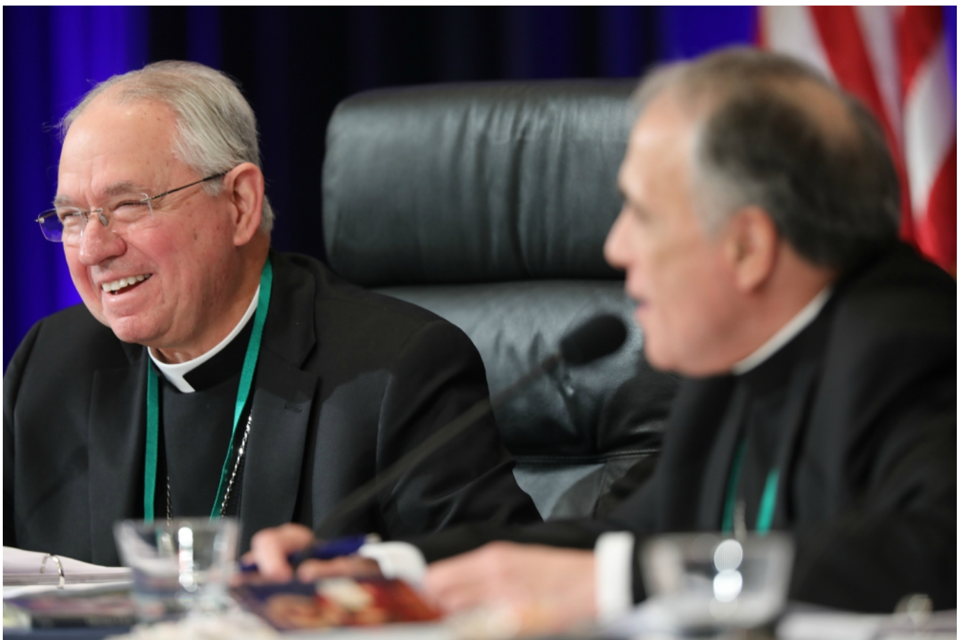
Los Angeles Archbishop José Gomez, president-elect of the U.S. Conference of Catholic Bishops, and outgoing president, Galveston-Houston Cardinal Daniel DiNardo, smile during the U.S. bishops' fall general assembly in Baltimore Nov. 13.

The bishops also voted to begin developing a formal statement and comprehensive vision for Hispanic/Latino ministry in response to the synodal V Encuentro process. And they elected the first Latino as president of the conference, Los Angeles Archbishop José Gomez .